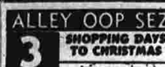
ALLEY OOP SEZ SHOPPING DAYS TO CHRISTMAS